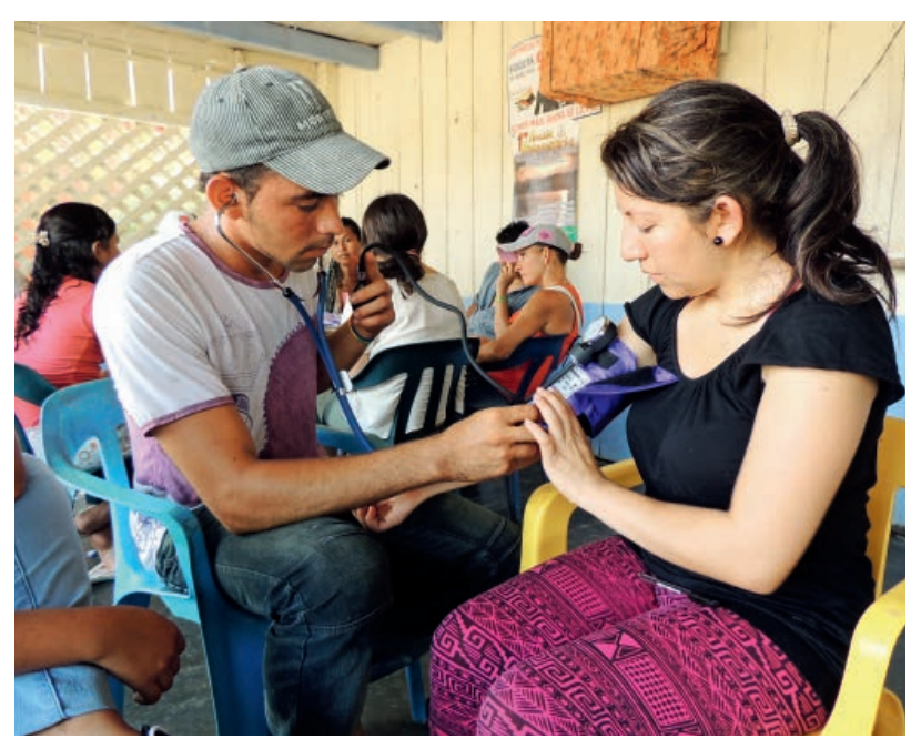
With the help of a medical student (right), a member of the Valle del Río Cimitarra community learns how to measure blood pressure. Through MIT support, the classes are helping to improve health care in the region.

"MIT projects help to change realities, not only for the people who receive the help but also for the ones who participate as leaders in the project," Suarez says. "It helps us realize that it is possible to change the world."