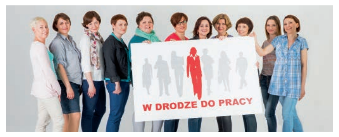
The "On the Way to Work" project empowered unemployed women to further develop the skills they need to get back on their feet professionally.

The project has already begun to bear fruit. By October 2014, 27 women of the 60 involved had already found new jobs. Others are participating in recruitment processes or in additional vocational trainings in order to gain new skills to enter completely new career paths. Some have decided to open their own small businesses. The second round of the project began in October 2014 with another group of 20 long-term unemployed women.