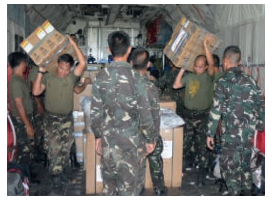
Photo left: The Red Cross delivered Henkel donations totaling six tons of detergent and 29,000 hygiene products to the Serbian cities of Ćićevac, Trstenik and Rekavac.

Photo right: Philippine soldiers assisted in unloading laptops and computers in the city of Tacloban.