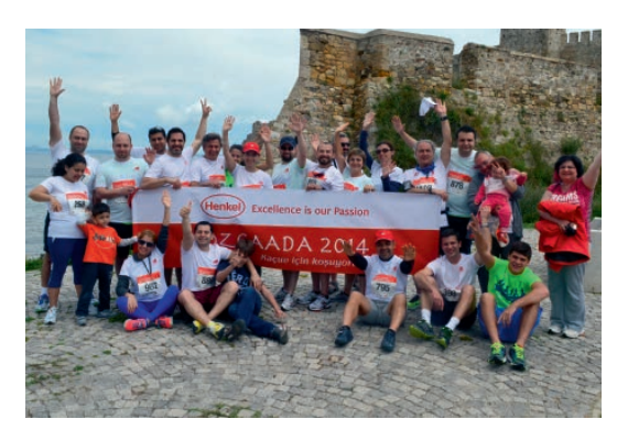
Henkel colleagues all fired up and ready to run before the race.

In Turkey, Henkel employees tightened up their running shoes and hit the road for the Hope Foundation for Children with Cancer (KAÇUV) in May 2014. The group of 18 runners ran 10 kilometers in the Bozcaada New Balance 10K Run and collected