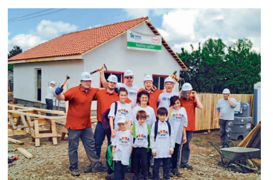
Photo left: The house slowly took on shape. Everyone lent a hand when it was time for the framework to be put up.

Photo right: Some members of the Henkel building team sharing the Rudaru family's happiness and pride in the new house.