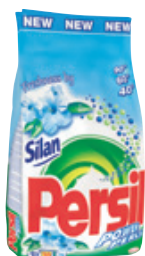
Persil with the freshness of Silan