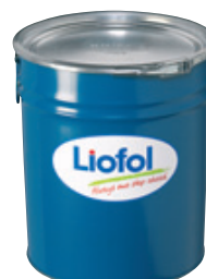
Liofol: a new generation of laminating adhesives